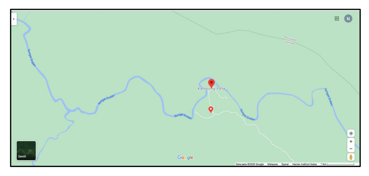
Map 2: Map of Endau-Rompin National Park.

Located in the vicinity of the forested area and along Endau River (see map below - taken from google map), the livelihood of the villagers relies heavily on natural resources in the surrounding area. Their economic activities include fishing, hunting, farming and collection of forest products such as petai and rattan.